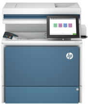
HP Color LaserJet Enterprise MFP 5800f Printer

This printer is intended to work only with cartridges that have a new or reused HP chip, and it uses dynamic security measures to block cartridges using a non-HP chip. Periodic firmware updates will maintain the effectiveness of these measures and block cartridges that previously worked. A reused HP chip enables the use of reused, remanufactured, and refilled cartridges. More at: http://www.hp.com/learn/ds