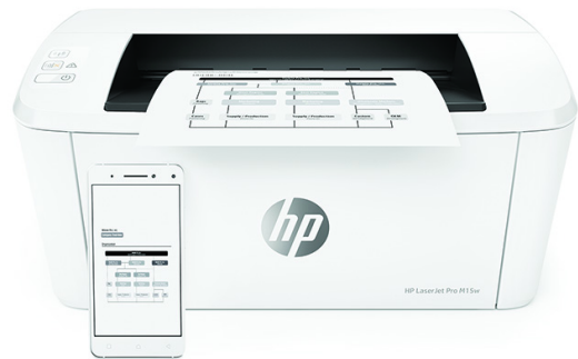
HP LaserJet Pro M15w Printer

Dynamic security enabled printer. Only intended to be used with cartridges using an HP original chip. Cartridges using a non-HP chip may not work, and those that work today may not work in the future. Learn more at: http://www.hp.com/go/learnaboutsupplies